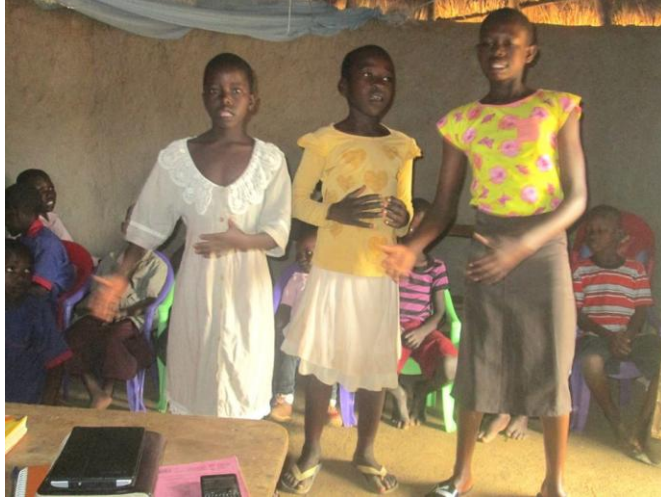
Children singing to the Lord