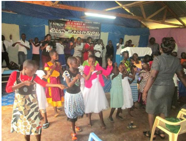
Singing and dancing before the LORD