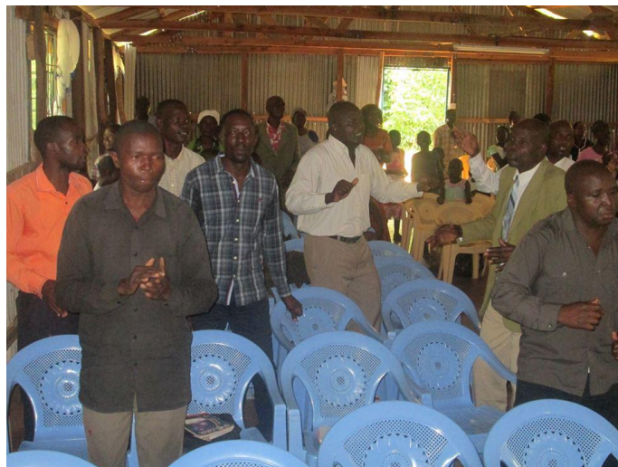
God is so good to us all, all the time.