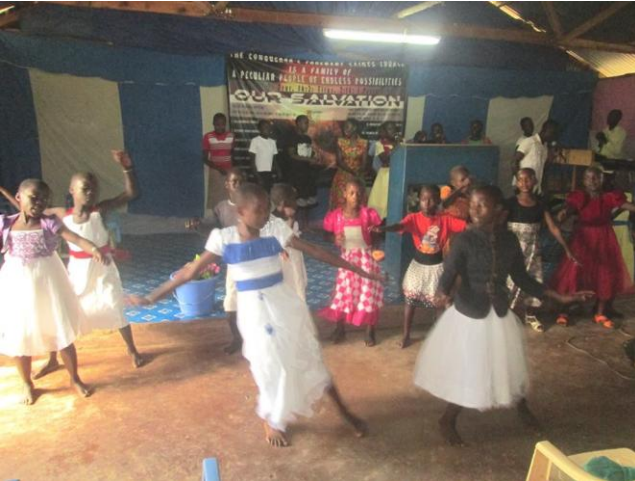
Dancing before the LORD