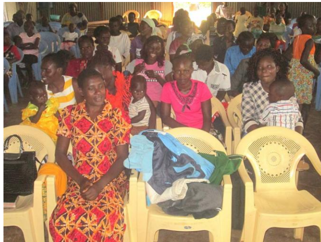
Glory to His name