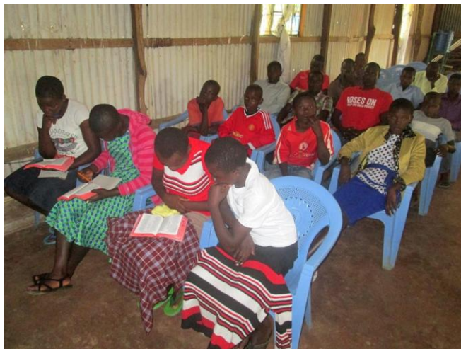
What a blessing to see these young people reading God's Word.