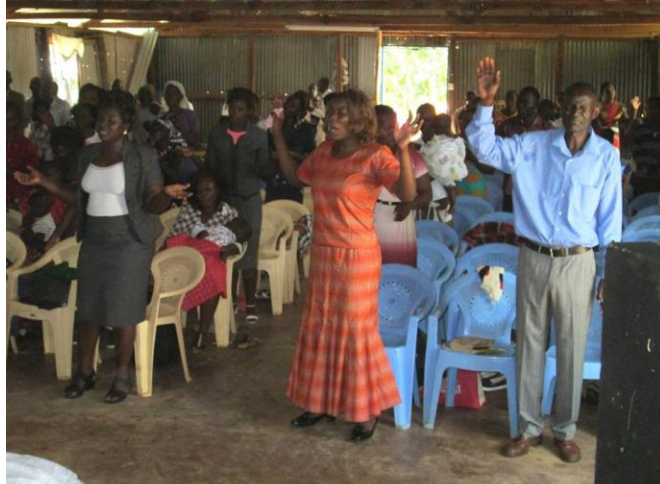
Pour your heart out in worship to the LORD