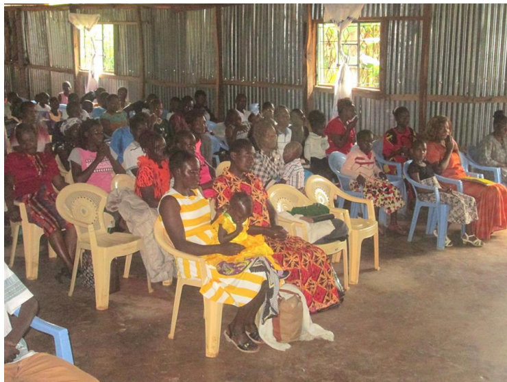
Coming together in Africa