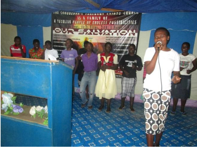
Making a joyful noise unto the LORD

our wonderful Youths in the word of God. I have posted pictures of some of our youths who attended the meeting. Hope they will bless your hearts.