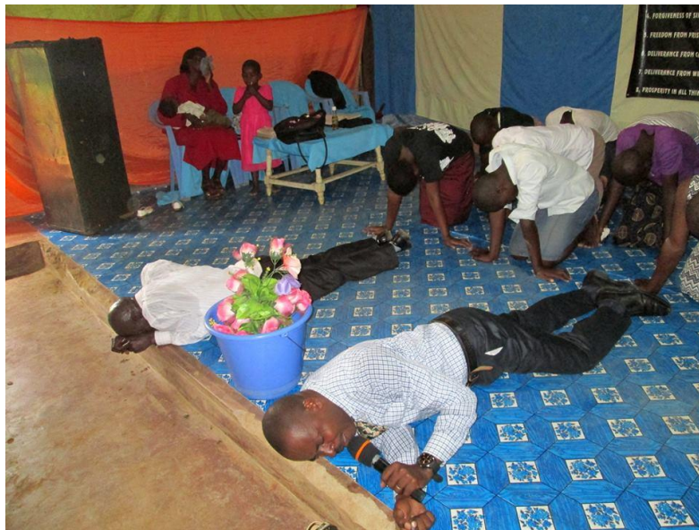
Could not resist prostrating to worship God.