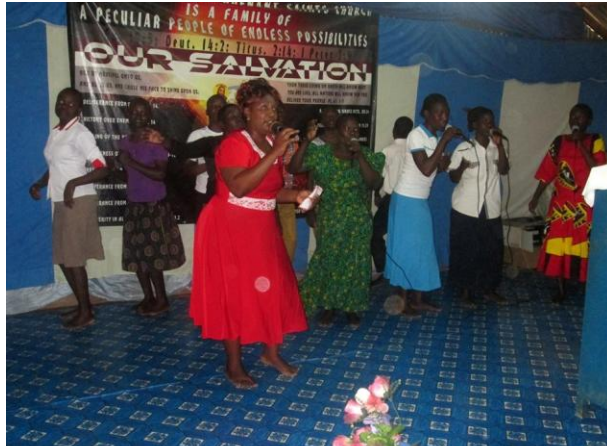
Praising & dancing to the Lord!