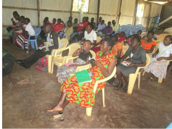
Hearing the Word of God.