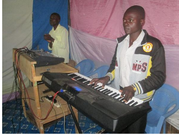
Praise God for their gifts and talents being used for His glory.