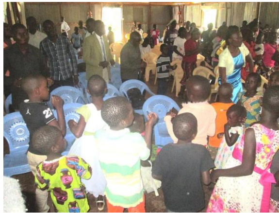
In God's House