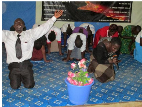
Let's kneel before the Lord & worship Him.