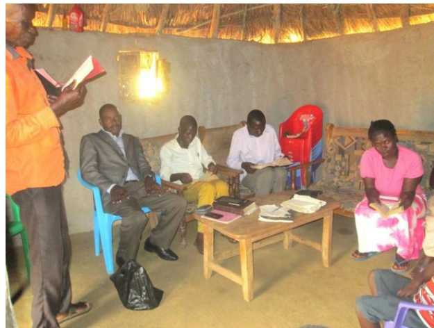
Sharing at church