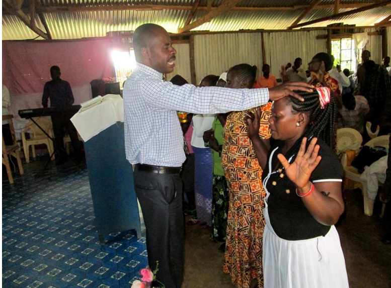
Laying holy hands on God's children in prayer.

Our loving friends and family your prayers & support has helped us come this far by God's grace. There is more we are trusting God to help us fulfill, kindly continue standing with us. We appreciate you all.