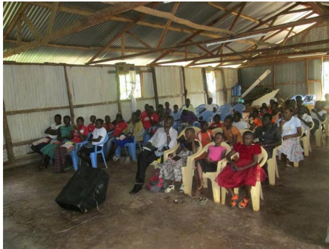
Faith comes by hearing the Word of God.

We request for your prayers for these wonderful young brothers sisters in the Lord. Thank you all our dear friends and supporters for your love, prayers and giving towards our ministry work.