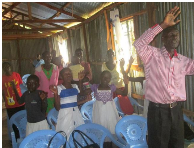
Worship Jesus Christ, He is worthy.