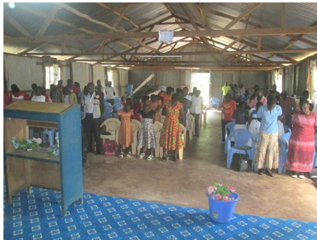
What a wonderful turn out for church