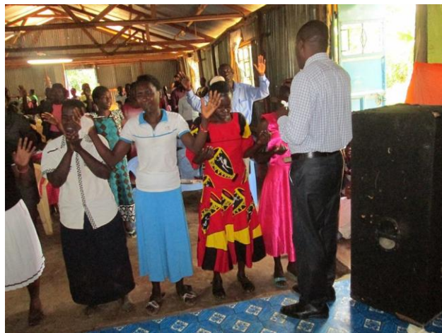
Coming forward for prayer