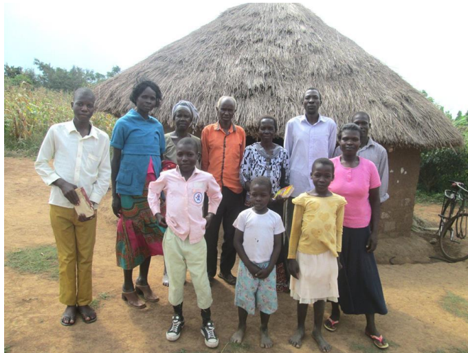
The congregation at the Uganda church